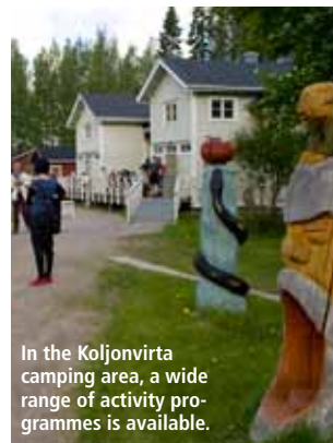
In the Koljonvirta camping area, a wide range of activity programmes is available.

Multimedia Theatre about the Finnish War Battle of Koljonvirta, 27 Oct 1808. Duration: about 1 h. Koljonvirta Holiday Centre Ylemmäisentie 6 Tel. (+358 17) 825 252 Open 27 Jun–31 Jul, Tue–Thu 7pm, Sun 1pm. At other times by appointment, tel. +358 50 321 3846